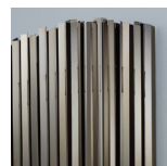
Polished black nickel