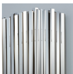
Polished stainless steel