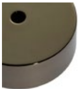
Polished black nickel