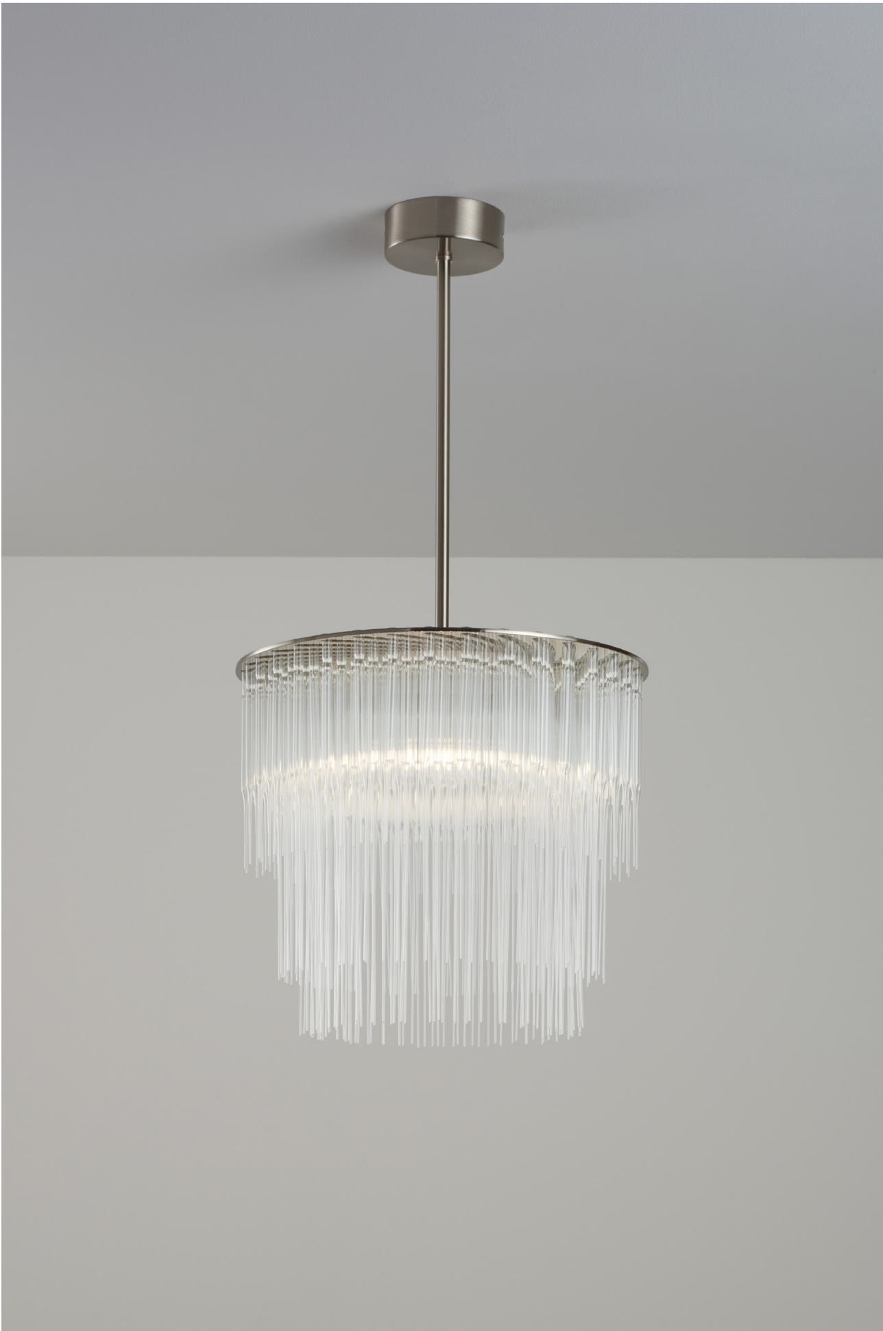
GS Pendant 300