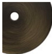
Brass based bronze