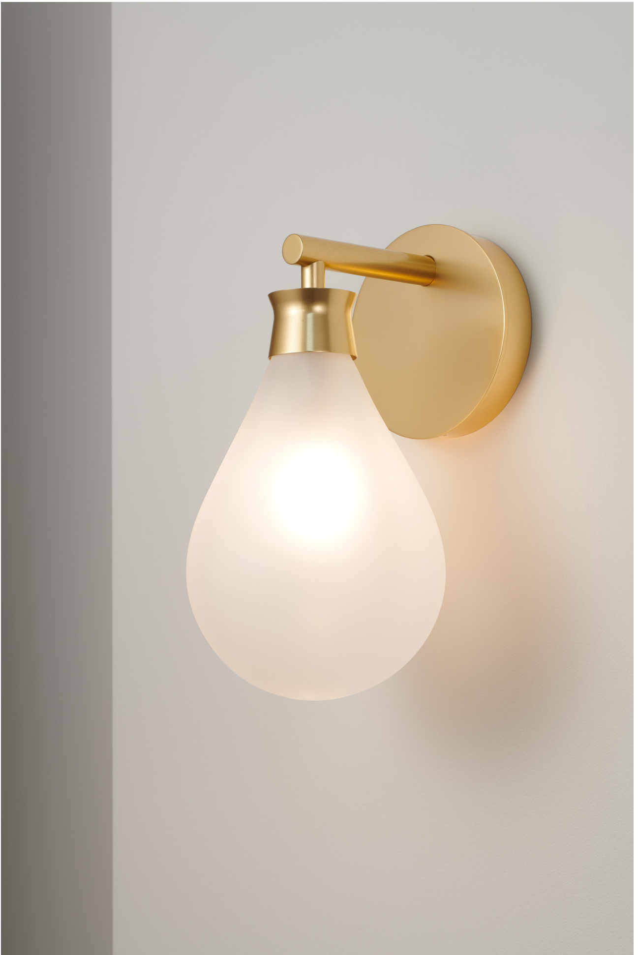
Cintola Wall Light