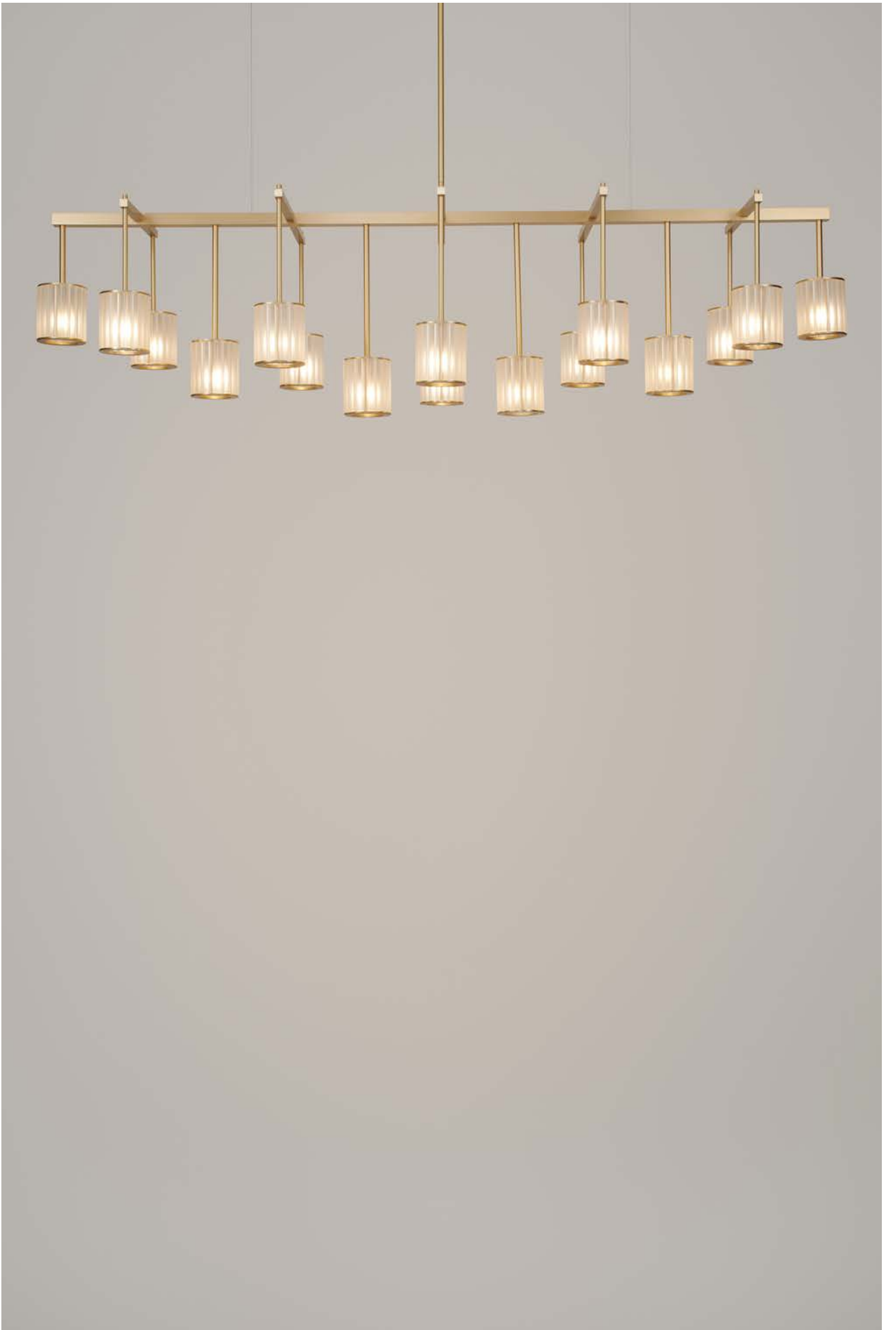
Flute Beam Chandelier