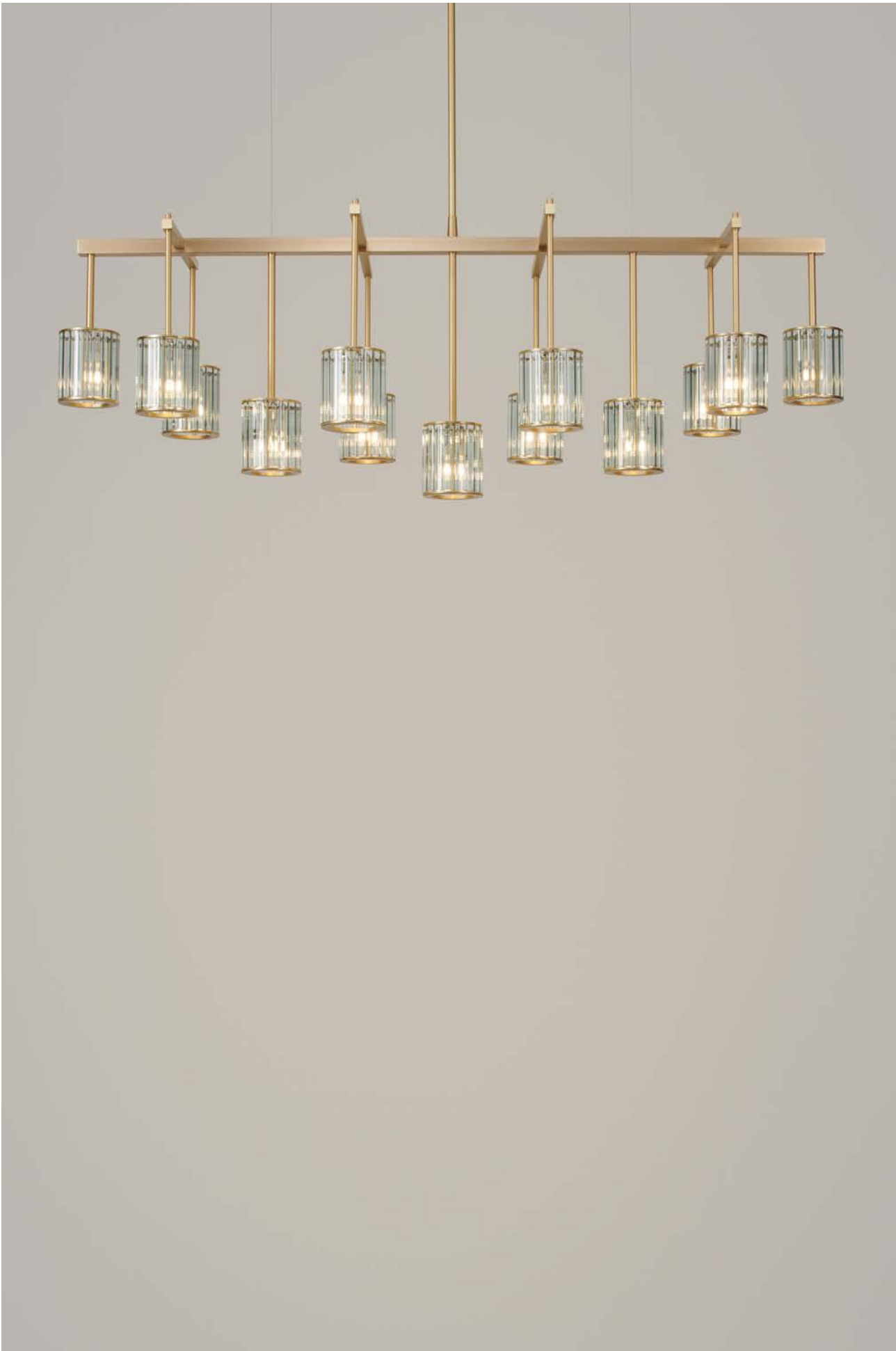
Flute Beam Chandelier