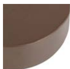
Powdercoated RAL colour