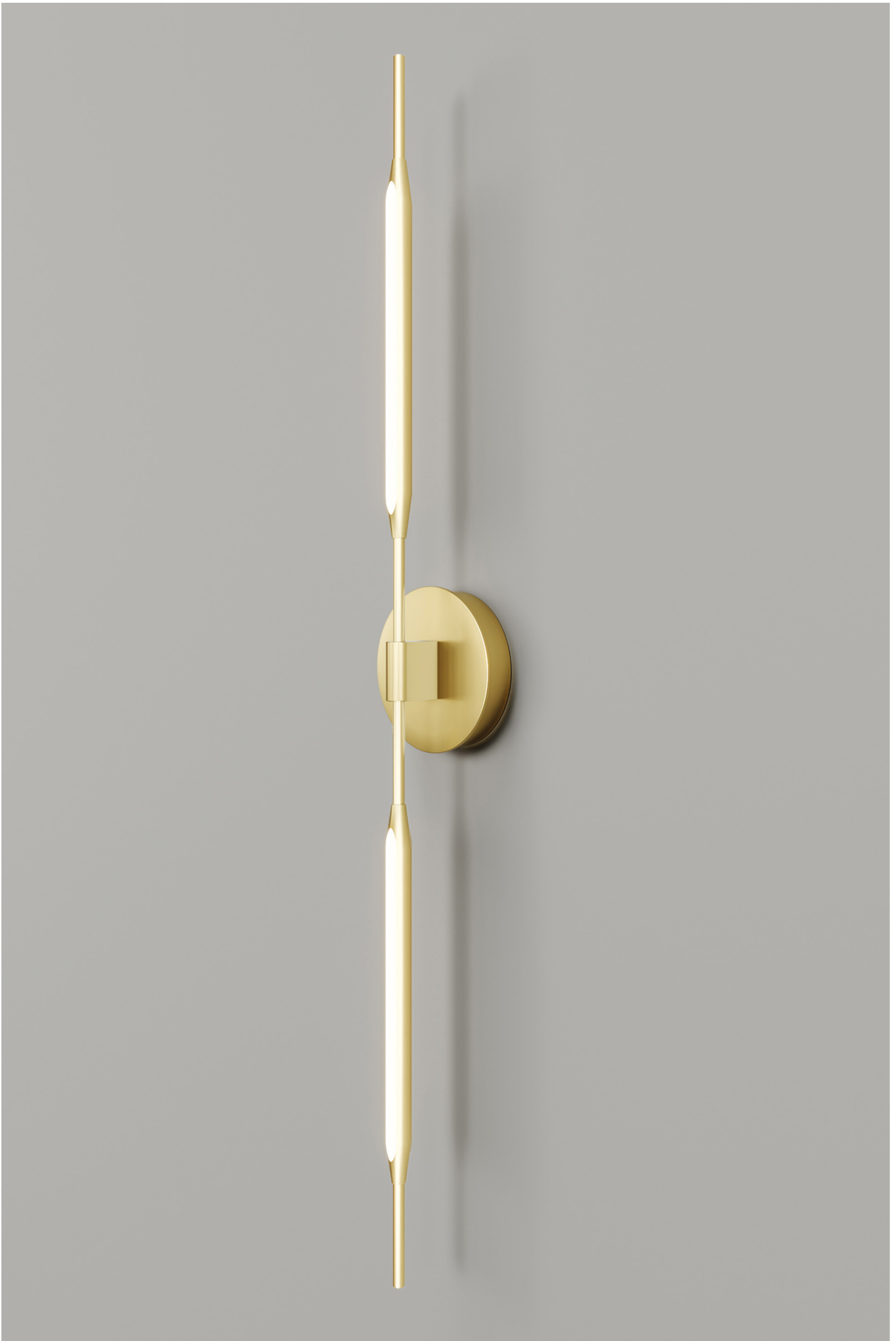
Reed Wall Light