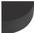
Matt black Powder-coat