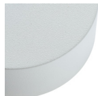
Matt white Powder-coat