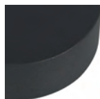
Matt black Powder-coat