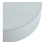
Matt white Powder-coat