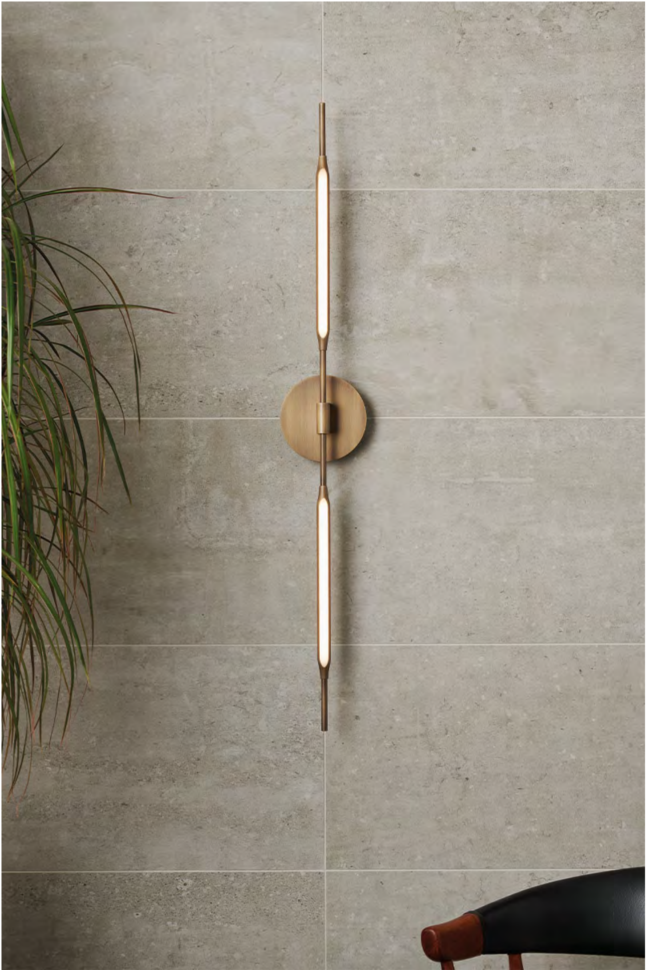
Reed Wall Light